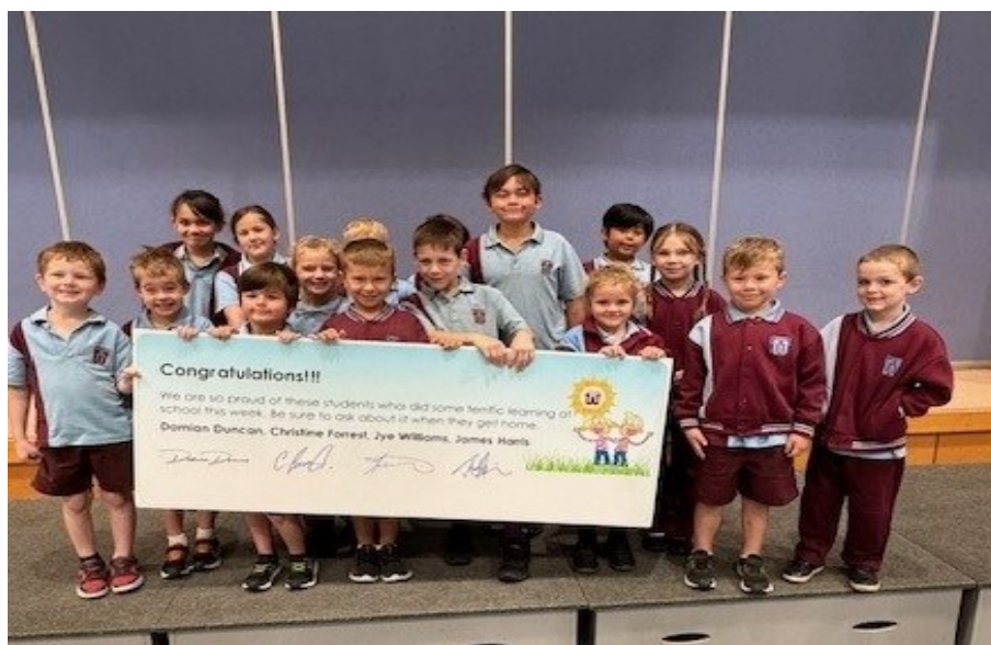
Congratulations to all our Happy Card recipients from last week!