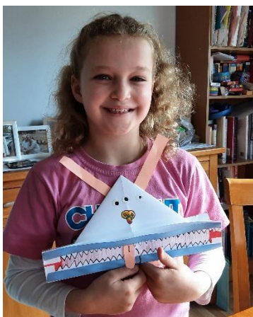
Lucy – MI5

Below are some photos sent in of our wonderful students at work during remote learning.