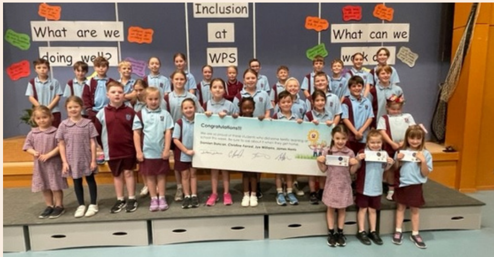
This week's Happy Card Recipients. Congratulations to everyone who received this good news.