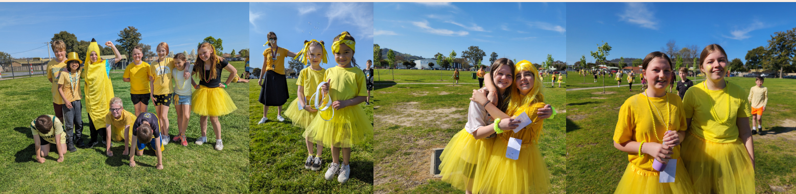
Our Walkathon & R U ok day on the last Thursday of Term 3 was a huge success

We hope you had a great break over the holidays, the weather was superb for getting out and about. This term is a long one, with 11 and half weeks of school. Communication will be a key for families to have a successful completion to the school year, be sure to review the event notifications at the back of the this newsletter each week & the year level newsletters. We especially look forward to the celebrations of student learning towards the end of term.