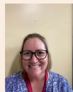
Donna Trudhope ES Classroom