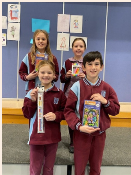
Maths Challenge Winners

I bought something at a supermarket and got 5c change. How much did it cost and how much money did I give to pay for it?