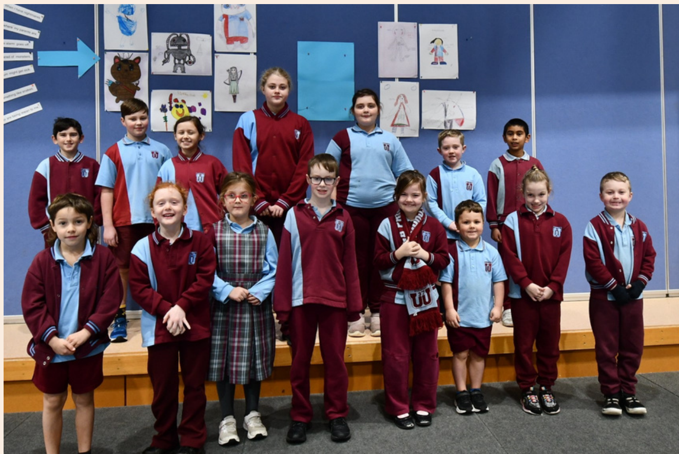
Students with 100% Semester One Attendance

Congratulations to the students who didn't miss a day of school last semester!!! Your commitment to your learning is commendable, and your ability to dodge illness!! Great job!!