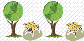
Elgin Ext: Year 5