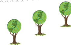
Osburn Building: Year 3